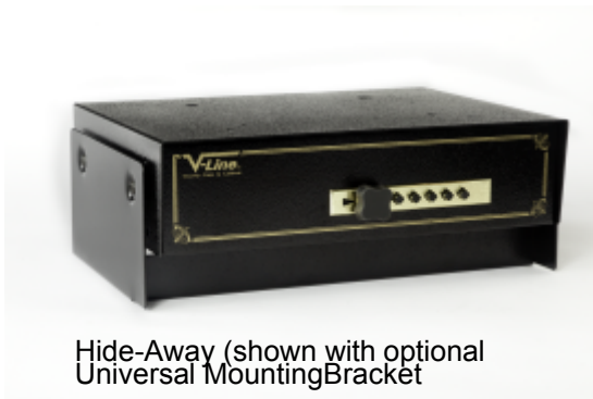
Hide-Away (shown with optional Universal Mounting Bracket)