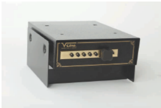
Desk Mate shown with optional Universal Mounting Bracket